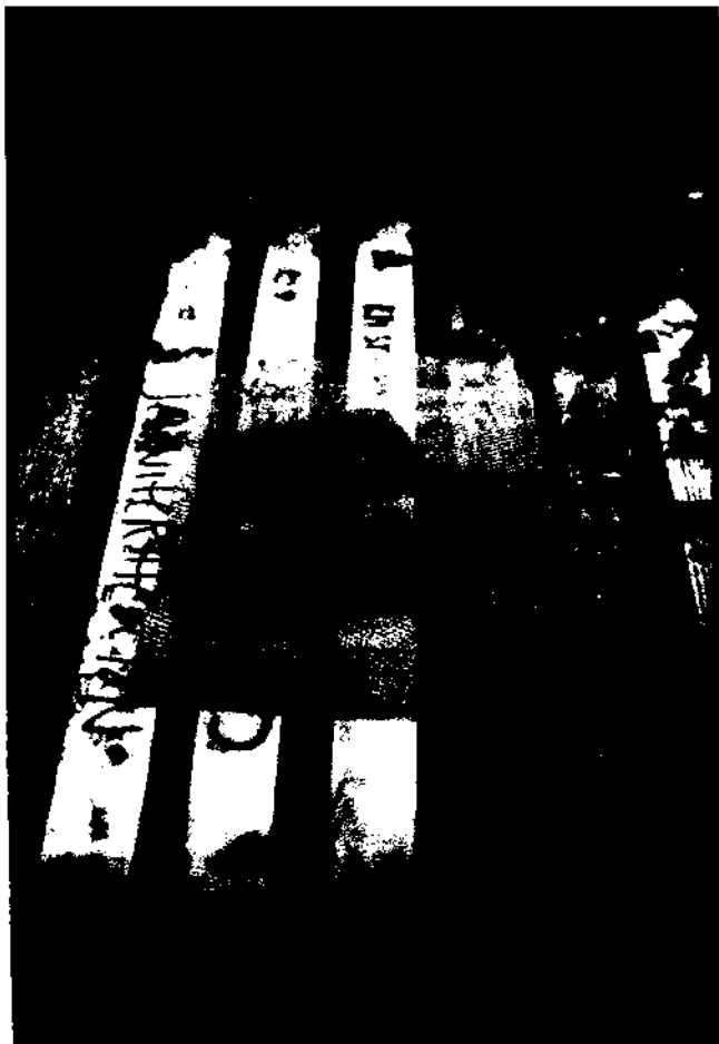
Figure 2. Apilife VAR™ wafers were enclosed in #8 mesh screen to prevent bees from removing the material from the hive.

tained at least 100 cm 2 sealed brood on each side. Samples of brood combs were measured in order to determine average brood area (cm 2 ) and number of adult varroa mites per sealed brood cell. These data permitted us to calculate for each colony within an apiary the starting bee population, brood area, and varroa mite population (Delaplane & Hood 1997, 1999). Because bees and brood were pooled together from a variety of colonies, queens were installed in the reconfigured experimental colonies without regard to their former workers or brood. Queens were clipped, marked, and individually caged within each colony. Queens were released 3-11 days after colony installation, depending on the degree of queen rejection behavior being displayed by the colony. Colonies were treated with Terramycin™ antibiotic to prevent foulbrood disease. All Georgia colonies were fed sugar syrup at one time when it was judged that dearth conditions warranted supplemental feeding. Additionally, 7-19 days after colony installation, each colony was given one super of honey above a queen excluder. Queen cells were removed from colonies weekly to discourage swarming.